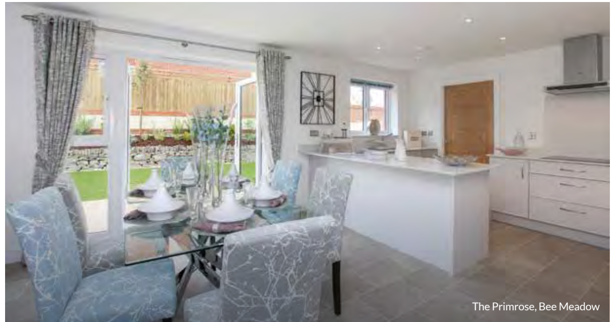
The Primrose, Bee Meadow