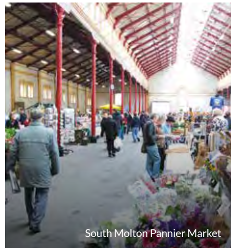
South Molton Pannier Market