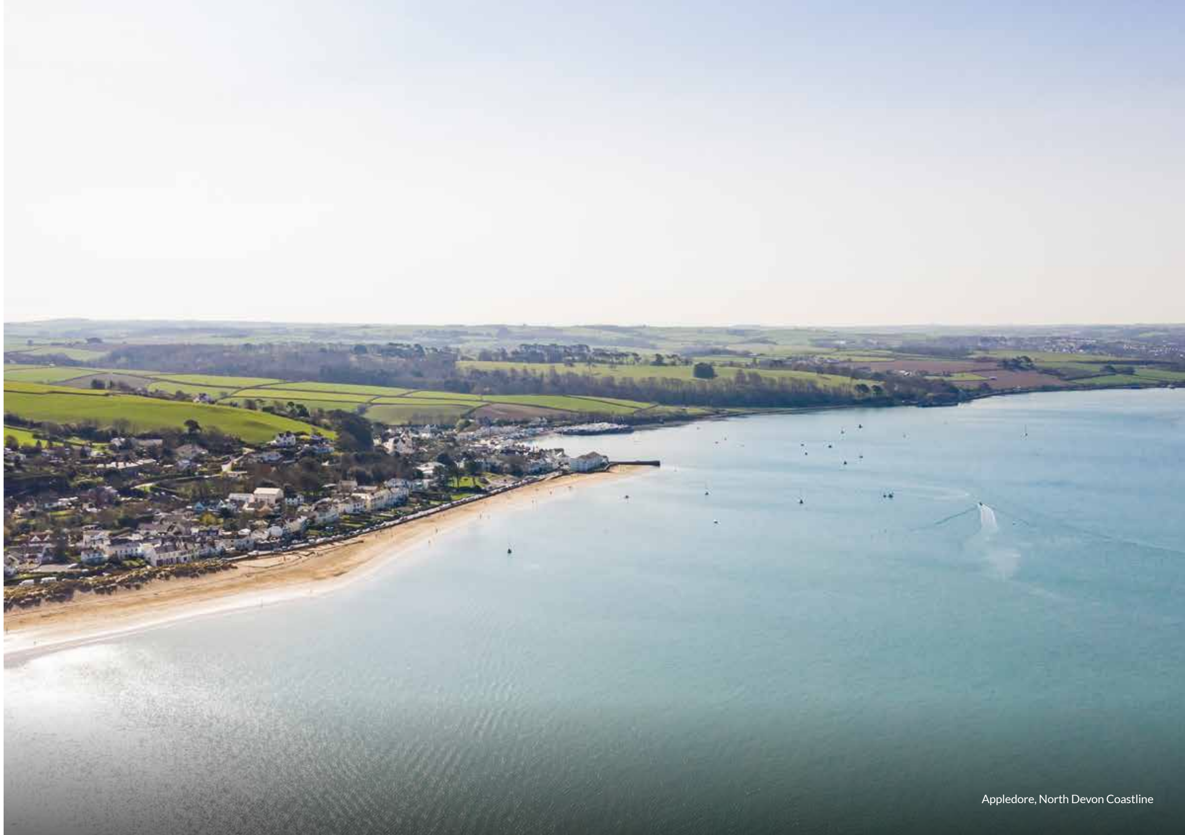
Appledore, North Devon Coastline