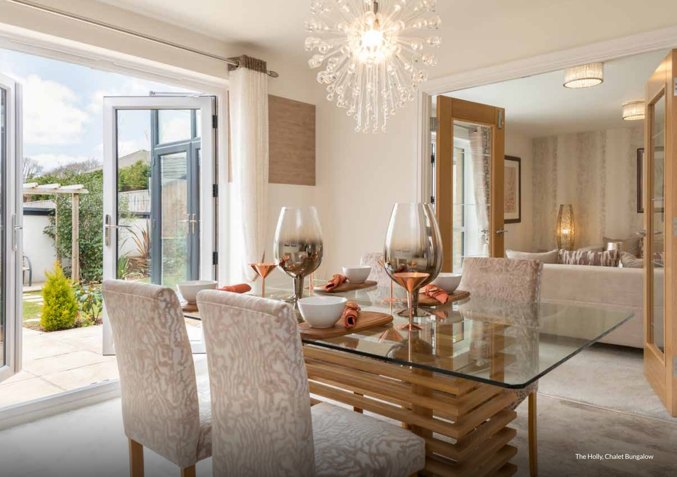
The Holly, Chalet Bungalow