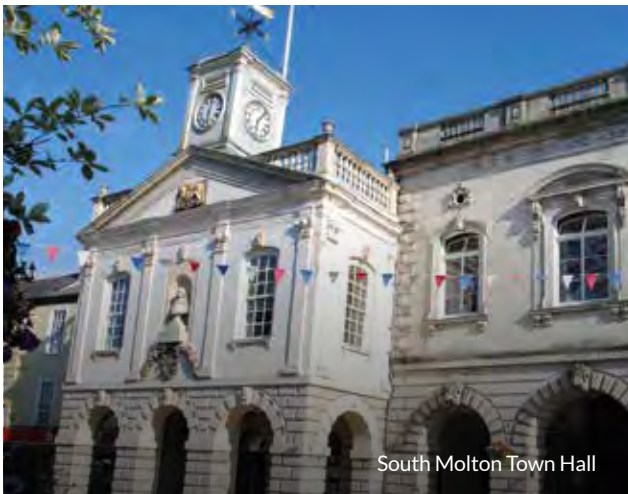
South Molton Town Hall