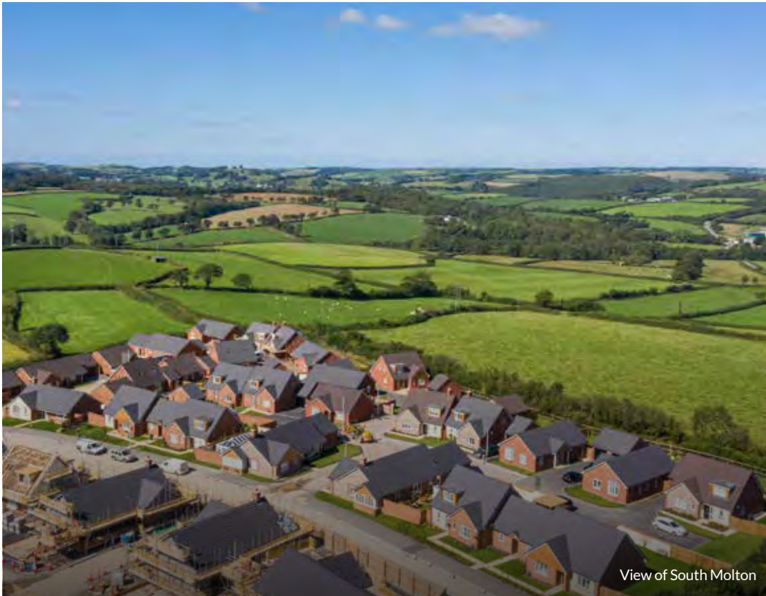
View of South Molton

There are regular bus services running through South Molton, providing links to Barnstaple and Tiverton. The beautiful North Devon coast is within easy reach – there, you will discover fantastic scenery, with lots of walks and a growing cycle network to take you across Exmoor and North Devon. The North Devon link road (A361) also gives good access to the M5 motorway at junction 27, just 25 miles away, with intercity rail connections to London Paddington from Tiverton Parkway, in just over 2 hours. For travel further afield, Exeter Airport is approximately 40 miles away.