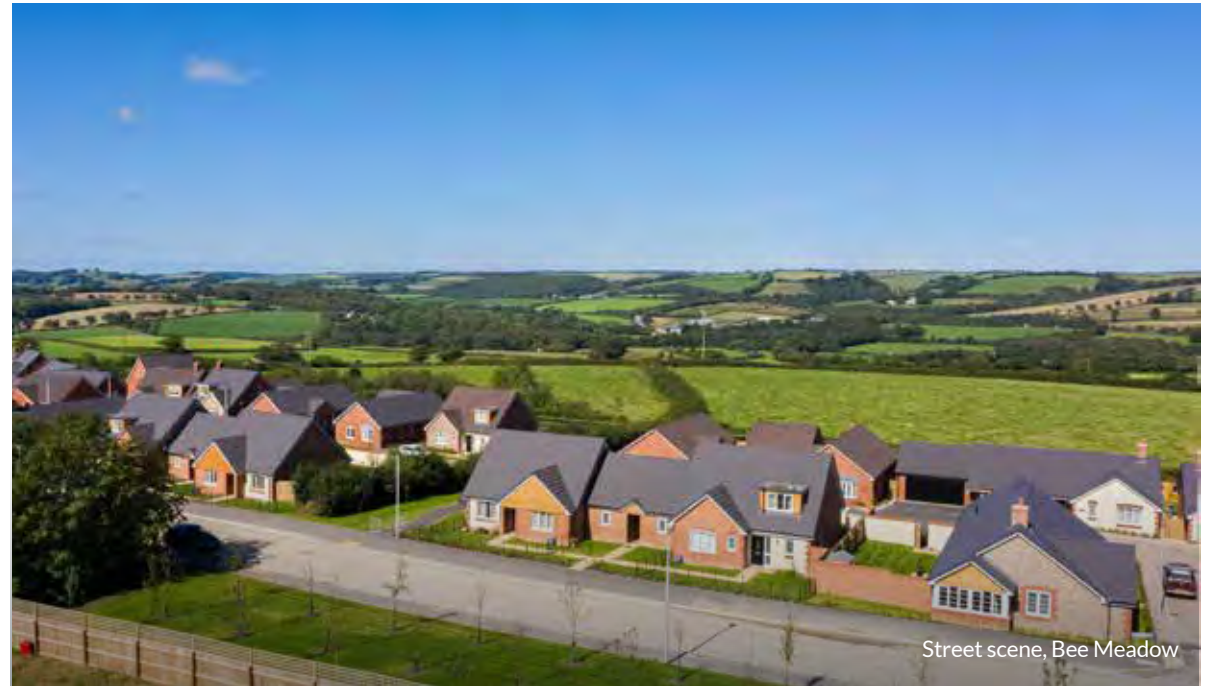
Street scene, Bee Meadow

Baker Estates – good things happen here.